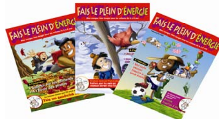
Automne – Publication # 012980 Hiver – Publication # 012982 Printemps/Été – Publication # 012981