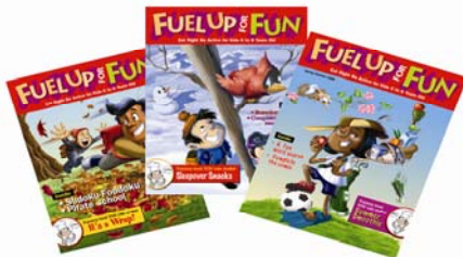
Fall – Publication # 012977 Winter – Publication # 012979 Spring/Summer – out-of-print