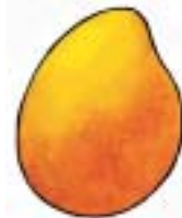
Food: 40: Mango File: 40-MANGO.tif 40-MANGO.jpg