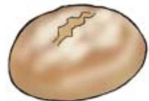
Food: 15: Corn bread File: 15-CNBRD.tif 15-CNBRD.jpg