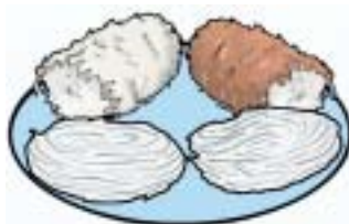
Food: 27: Pittu and Stringhoppers File: 27-PITTU.tif 27-PITTU.jpg