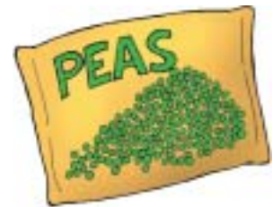
Food: 64: Frozen peas File: 64-PEAS.tif 64-PEAS.jpg