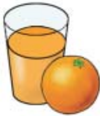
Food: 54: Orange juice and orange File: 54-ORANG.tif 54-ORANG.jpg