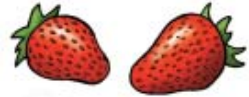
Food: 56: Strawberries File: 56-STRAW.tif 56-STRAW.jpg