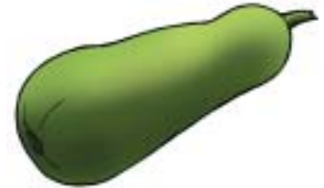
Food: 85: Long gourd File: 85-LNGRD.tif 85-LNGRD.jpg