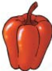
Food: 62: Red pepper File: 62-RDPEP.tif 62-RDPEP.jpg