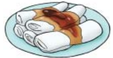
Food: 19: Fresh rice rolls File: 19-RCRLS.tif 19-RCRLS.jpg