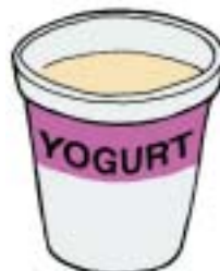
Food: 101: Yogurt File: 101-YOG.tif 101-YOG.jpg