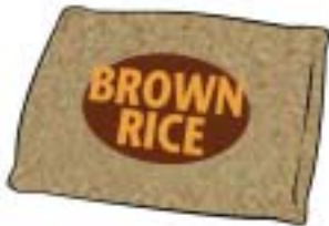
Food: 5: Brown rice File: 5-BNRICE.tif 5-BNRICE.jpg