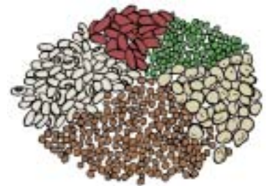
Food: 121: Dried beans File: 121-BNS.tif 121-BNS.jpg