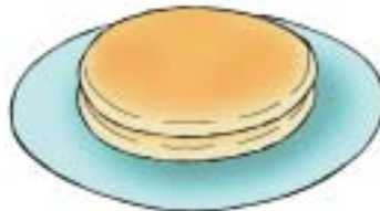
Food: 9: Pancakes File: 9-PNCAKE.tif 9-PNCAKE.jpg