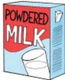
Food: 94: Powdered milk File: 94-PWMLK.tif 94-PWMLK.jpg