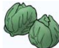
Food: 52: Brussel Sprouts File: 52-BRUS.tif 52-BRUS.jpg