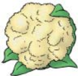
Food: 46: Cauliflower File: 46-CAULI.tif 46-CAULI.jpg