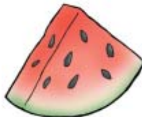
Food: 66: Watermelon File: 66-WTRML.tif 66-WTRML.jpg