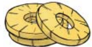
Food: 69: Pineapple File: 69-PINE.tif 69-PINE.jpg