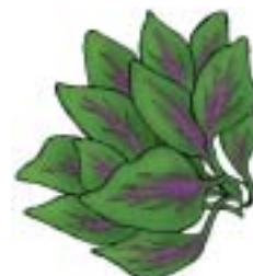
Food: 92: Amaranth File: 92-AMARA.tif 92-AMARA.jpg