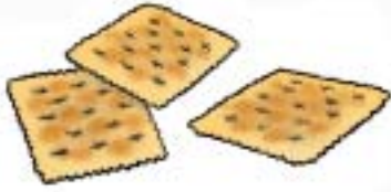
Food: 1: Crackers File: 1-CRACKR.tif 1-CRACKR.jpg