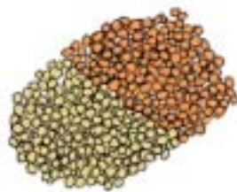
Food: 123: Dried lentils File: 123-LENT.tif 123-LENT.jpg