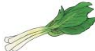
Food: 72: Chinese greens File: 72-CNGRN.tif 72-CNGRN.jpg