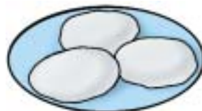
Food: 28: Itli File: 28-ITLI.tif 28-ITLI.jpg