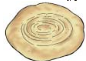
Food: 26: Dosa File: 26-DOSA.tif 26-DOSA.jpg