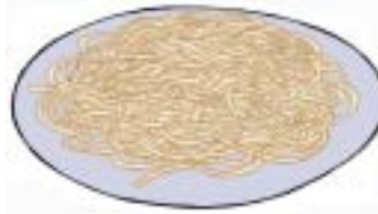
Food: 7: Plate of spaghetti File: 7-SPAGET.tif 7-SPAGET.jpg