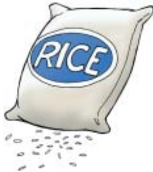
Food: 6: Bag of white rice File: 6-WTRICE.tif 6-WTRICE.jpg