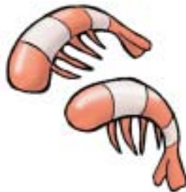
Food: 119: Shrimp File: 119-SHMP.tif 119-SHMP.jpg