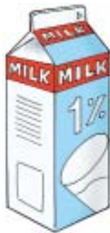
Food: 97: 1% milk File: 97-1MLK.tif 97-1MLK.jpg