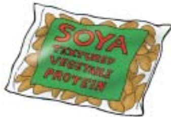
Food: 134: Textured soy protein File: 134-SOYP.tif 134-SOYP.jpg