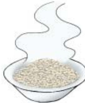
Food: 10: Bowl of hot cereal File: 10-HTCER.tif 10-HTCER.jpg