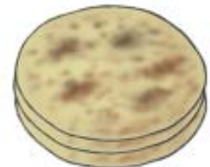
Food: 30: Tortillas File: 30-TORTI.tif 30-TORTI.jpg