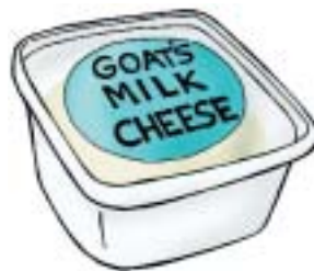
Food: 107: Goats milk cheese File: 107-GTMK.tif 107-GTMK.jpg