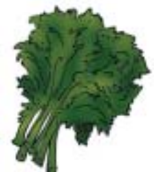
Food: 73: Rapini File: 73-RAPIN.tif 73-RAPIN.jpg