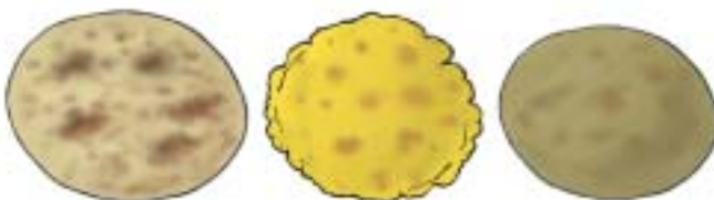
Food: 24: Roti File: 24-ROTI.tif 24-ROTI.jpg