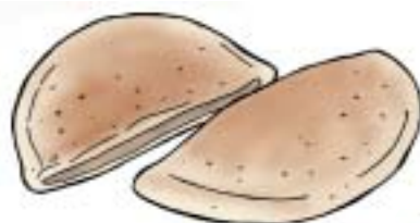
Food: 13: Pita File: 13-PITA.tif 13-PITA.jpg