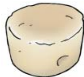
Food: 108: Serra cheese File: 108-SRCH.tif 108-SRCH.jpg