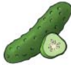
Food: 35: Cucumber File: 35-CUCMB.tif 35-CUCMB.jpg