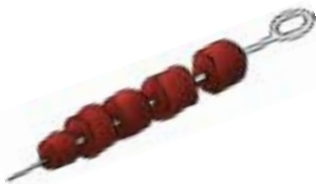
Food: 115: Beef kebabs File: 115-KEBA.tif 115-KEBA.jpg