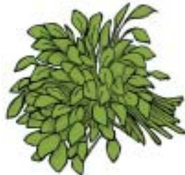
Food: 87: Fenugreek File: 87-FENGK.tif 87-FENGK.jpg