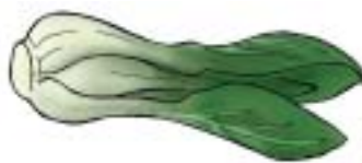
Food: 91: Baby bok choy File: 91-BYBCY.tif 91-BYBCY.jpg