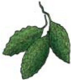
Food: 86: Bitter gourd File: 86-BITGD.tif 86-BITGD.jpg