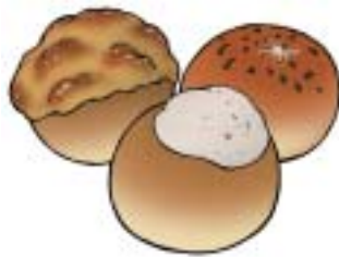
Food: 17: Hong Kong buns File: 17-HNHKB.tif 17-HNHKB.jpg