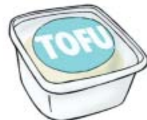
Food: 102: Tofu File: 102-TOFU.tif 102-TOFU.jpg