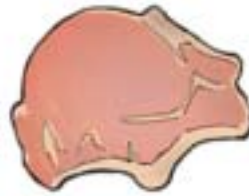
Food: 113: Pork chop File: 113-PORK.tif 113-PORK.jpg