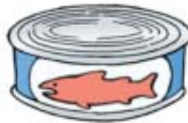
Food: 120: Canned fish File: 120-FISH.tif 120-FISH.jpg