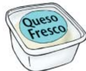
Food: 136: Queso Fresco File: 136-QFRE.tif 136-QFRE.jpg