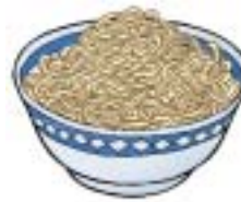
Food: 22: Bowl of noodles File: 22-BLNOD.tif 22-BLNOD.jpg