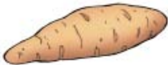
Food: 37: Sweet potato File: 37-SWPOT.tif 37-SWPOT.jpg