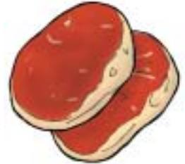
Food: 114: Beef File: 114-BEEF.tif 114-BEEF.jpg