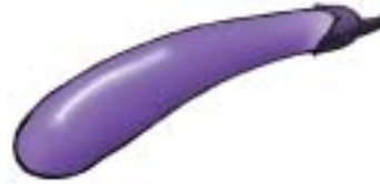
Food: 76: Chinese eggplant File: 76-EGGPT.tif 76-EGGPT.jpg