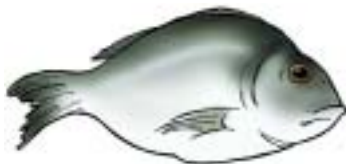
Food: 118a: Fish File: 118a-FSH.tif 118a-FSH.jpg