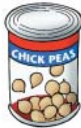
Food: 127: Canned chick peas File: 127-CHPE.tif 127-CHPE.jpg