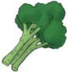
Food: 33: Broccoli File: 33-BROC.tif 33-BROC.jpg