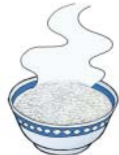
Food: 23: Bowl of congee File: 23-CONGE.tif 23-CONGE.jpg