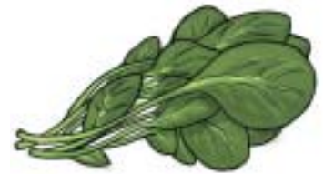
Food: 36: Spinach File: 36-SPIN.tif 36-SPIN.jpg