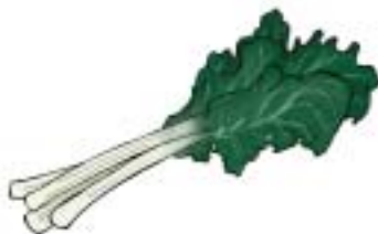
Food: 70: Swiss chard File: 70-SWCRD.tif 70-SWCRD.jpg