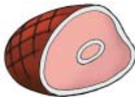
Food: 116: Ham File: 116-HAM.tif 116-HAM.jpg