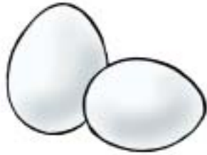
Food: 112: Eggs File: 112-EGGS.tif 112-EGGS.jpg