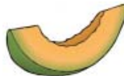
Food: 39: Cantaloupe File: 39-CANTA.tif 39-CANTA.jpg