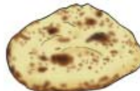
Food: 25: Naan File: 25-NAAN.tif 25-NAAN.jpg