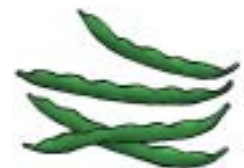
Food: 53: Green beans File: 53-GNBEN.tif 53-GNBEN.jpg