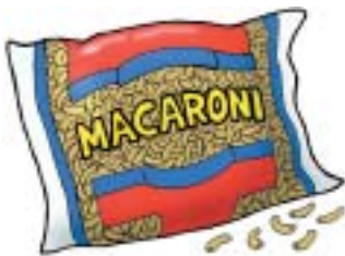
Food: 8: Bag of macaroni File: 8-MACRNI.tif 8-MACRNI.jpg