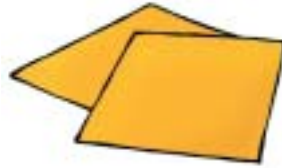
Food: 104: Cheese slices File: 104-CHEE.tif 104-CHEE.jpg