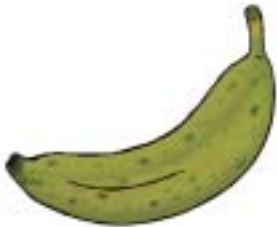
Food: 82: Plantain File: 82-PLANT.tif 82-PLANT.jpg