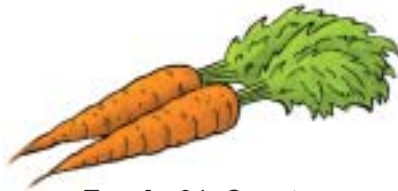
Food: 34: Carrots File: 34-CAROT.tif 34-CAROT.jpg