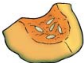
Food: 50: Piece of squash File: 50-SQUAS.tif 50-SQUAS.jpg