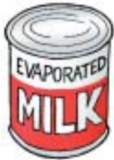
Food: 93: Evaporated milk File: 93-EVMLK.tif 93-EVMLK.jpg