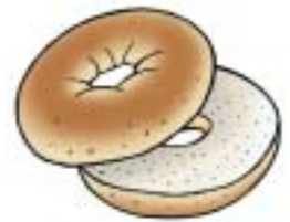
Food: 4: Bagel File: 4-BAGEL.tif 4-BAGEL.jpg