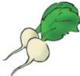
Food: 47: Turnips File: 47-TURN.tif 47-TURN.jpg