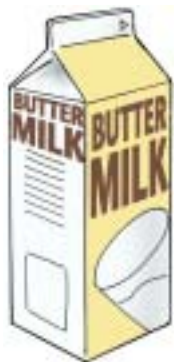
Food: 109: Buttermilk File: 109-BTMK.tif 109-BTMK.jpg