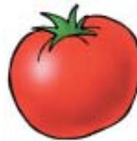
Food: 59: Tomato File: 59-TOMA.tif 59-TOMA.jpg