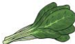
Food: 71: Collard greens File: 71-CLGRN.tif 71-CLGRN.jpg