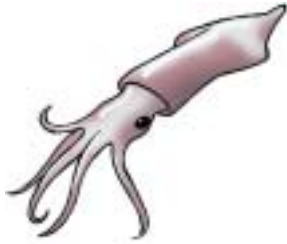
Food: 126: Squid File: 126-SQID.tif 126-SQID.jpg