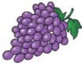
Food: 55: Grapes File: 55-GRAPE.tif 55-GRAPE.jpg