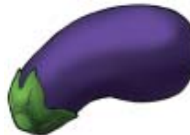
Food: 88: Eggplant File: 88-EGGPT.tif 88-EGGPT.jpg