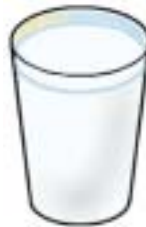
Food: 98: Glass of milk File: 98-GLMLK.tif 98-GLMLK.jpg