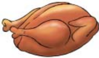
Food: 111: Chicken File: 111-CHIC.tif 111-CHIC.jpg