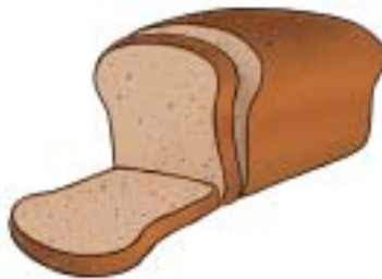
Food: 2: Bread File: 2-BREAD.tif 2-BREAD.jpg