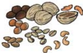
Food: 122: Nuts File: 122-NUTS.tif 122-NUTS.jpg