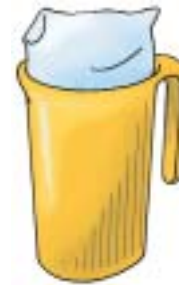
Food: 99: Pitcher of milk File: 99-PTMLK.tif 99-PTMLK.jpg