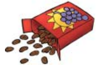
Food: 44: Raisins File: 44-RASIN.tif 44-RASIN.jpg