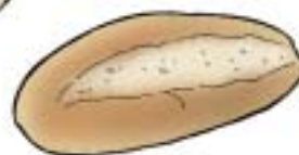
Food: 14: Paposeco File: 14-PAPOS.tif 14-PAPOS.jpg