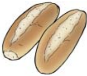
Food: 16: Rolls File: 16-ROLLS.tif 16-ROLLS.jpg