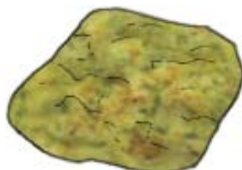
Food: 31: Paratha File: 31-PARAT.tif 31-PARAT.jpg