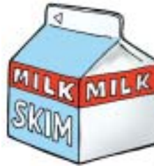
Food: 95: Skim milk File: 95-SKMLK.tif 95-SKMLK.jpg