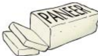
Food: 110: Paneer File: 110-PANR.tif 110-PANR.jpg