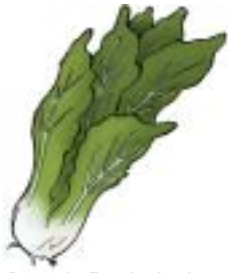
Food: 74: Pad choy File: 74-PADCO.tif 74-PADCO.jpg