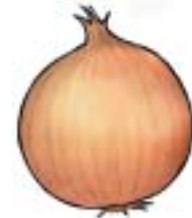
Food: 60: Onion File: 60-ONION.tif 60-ONION.jpg