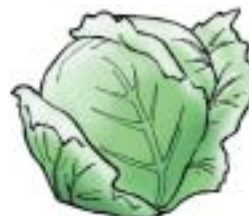
Food: 48: Head of Cabbage File: 48-CABBG.tif 48-CABBG.jpg