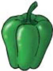
Food: 61: Green pepper File: 61-GRPEP.tif 61-GRPEP.jpg