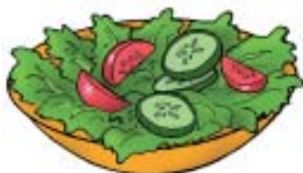
Food: 51: Salad File: 51-SALAD.tif 51-SALAD.jpg