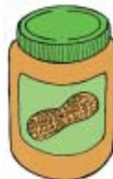
Food: 124: Peanut butter File: 124-PBUT.tif 124-PBUT.jpg