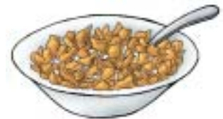
Food: 11: Bowl of cold cereal File: 11-BLCER.tif 11-BLCER.jpg