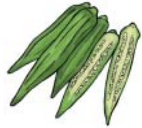
Food: 81: Okra File: 81-OKRA.tif 81-OKRA.jpg