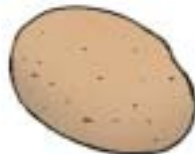
Food: 38: Potato File: 38-POTAT.tif 38-POTAT.jpg