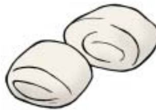
Food: 18: Cheung Fan Buns File: 18-CHFAN.tif 18-CHFAN.jpg