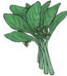
Food: 80: Choy sum File: 80-CHOYS.tif 80-CHOYS.jpg