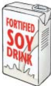
Food: 100: Fortified soy drink File: 100-SOY.tif 100-SOY.jpg