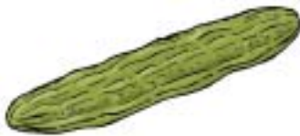
Food: 78: Bitter melon File: 78-BITML.tif 78-BITML.jpg