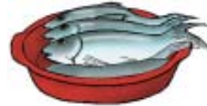
Food: 128: Mackerel File: 128-MACK.tif 128-MACK.jpg