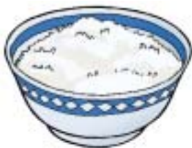
Food: 20: Bowl of rice File: 20-BLRIC.tif 20-BLRIC.jpg