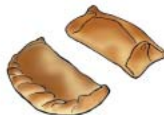
Food: 29: Empanada File: 29-EMPAN.tif 29-EMPAN.jpg