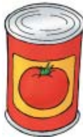
Food: 58: Canned tomatoes File: 58-CNTOM.tif 58-CNTOM.jpg