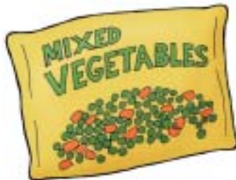
Food: 65: Frozen Mixed Vegetables File: 65-MXVEG.tif 65-MXVEG.jpg