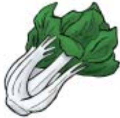
Food: 75: Bok choy File: 75-BOKCY.tif 75-BOKCY.jpg