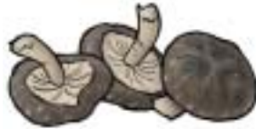
Food: 79: Mushrooms File: 79-MUSH.tif 79-MUSH.jpg