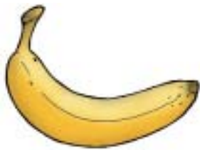
Food: 57: Bananas File: 57-BANAN.tif 57-BANAN.jpg