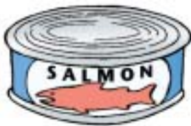
Food: 106: Can of salmon File: 106-SALM.tif 106-SALM.jpg