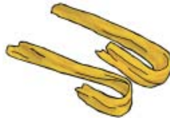
Food: 135: Soy bean stick File: 135-SOYB.tif 135-SOYB.jpg