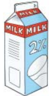
Food: 96: 2% milk File: 96-2MLK.tif 96-2MLK.jpg