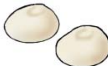
Food: 32: Vietnamese Buns File: 32-VIETB.tif 32-VIETB.jpg