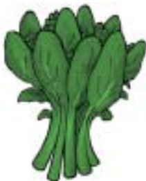
Food: 90: Chinese broccoli File: 90-CHBRO.tif 90-CHBRO.jpg