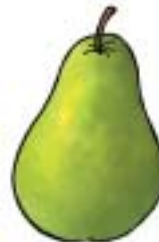
Food: 63: Pear File: 63-PEAR.tif 63-PEAR.jpg