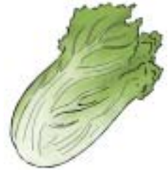
Food: 77: Napa Cabbage File: 77-NAPA.tif 77-NAPA.jpg