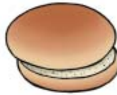
Food: 3: Hamburger bun File: 3-HAMBUN.tif 3-HAMBUN.jpg