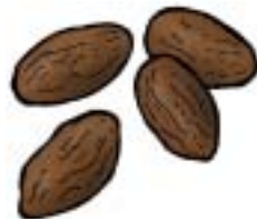
Food: 42: Dates File: 42-DATES.tif 42-DATES.jpg