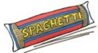
Food: 7a: Bag of spaghetti File: 7a-SPAGT.tif 7a-SPAGT.jpg