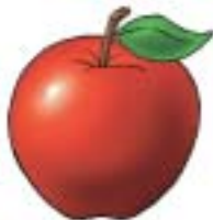
Food: 41: Apple File: 41-APPLE.tif 41-APPLE.jpg