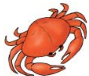
Food: 125: Crab File: 125-CRAB.tif 125-CRAB.jpg