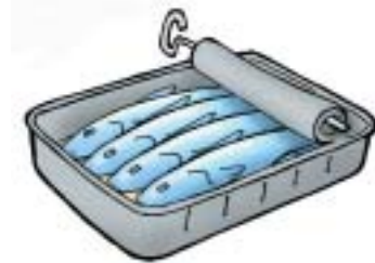
Food: 105: Can of sardines File: 105-SARD.tif 105-SARD.jpg