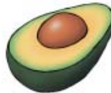
Food: 84: Avocado File: 84-AVAC.tif 84-AVAC.jpg