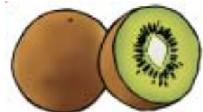
Food: 49: Kiwi File: 49-KIWI.tif 49-KIWI.jpg