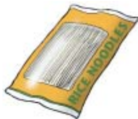
Food: 21: Bag of rice noodles File: 21-RICND.tif 21-RICND.jpg